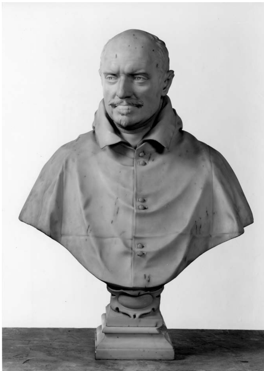
1. Cardinal Alessandro Damasceni-Peretti Montalto , by Gianlorenzo Bernini. Marble; height, with original base, 79 cm. (Kunsthalle, Hamburg).