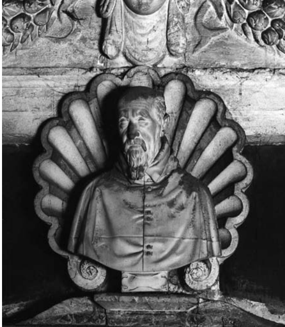
6. Cardinal Giovanni Dolfin , by Gianlorenzo Bernini. Marble, life-size (S. Michele all'Isola, Venice).