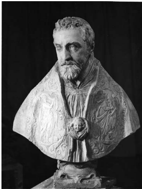
7. Cardinal Escoubleau de Sourdis , by Gianlorenzo Bernini. Marble, height 75 cm. (St. Bruno, Bordeaux).