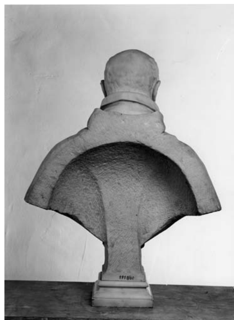
3. Rear view of the bust reproduced in Fig. 1.