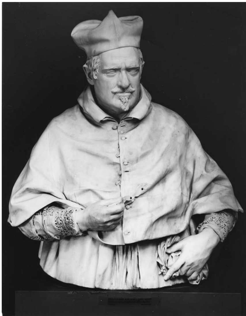
5. Cardinal Alessandro Damasceni-Peretti Montalto , attributed to Alessandro Algardi. Marble, height 91 cm. (Bode Museum, Berlin).