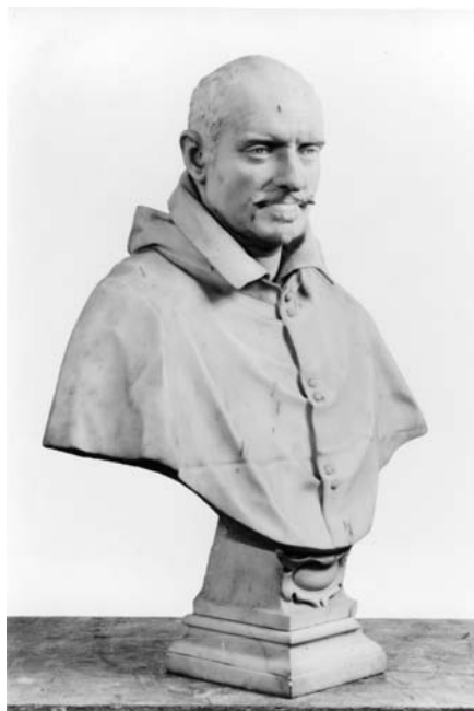
2. Another view of the bust reproduced in Fig. 1.