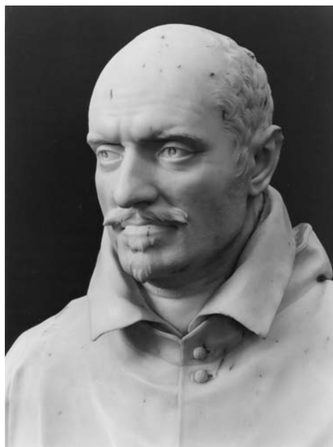
10. Detail of the bust reproduced in Fig. 1.