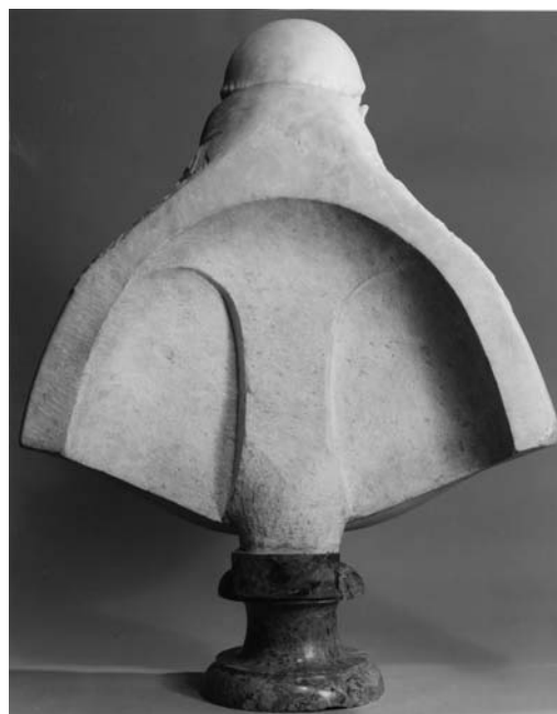
9. Rear view of bust of Pope Gergory XV, by Gianlorenzo Bernini. Marble, height 83.5 cm. (Aart Gallery of Ontario, Toronto).