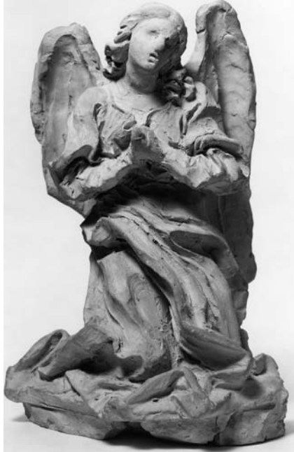
9. Angel for the Sacrament Altar , 1673. Terracotta, height 29 cm. Cambridge, Fogg Art Museum, 1937.62.