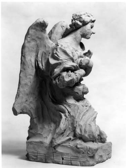
12. Angel for the Sacrament Altar , 1673. Terracotta, height 34 cm. Cambridge, Fogg Art Museum, 1937.63.