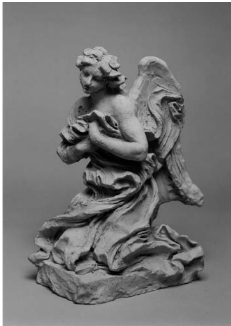
11. Angel for the Sacrament Altar , 1673. Terracotta, height 34 cm. Cambridge, Fogg Art Museum, 1937.63.