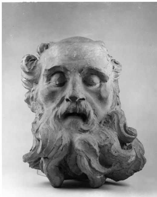
2. Head of St. Jerome , c. 1661. Terracotta, height 35.7 cm. Cambridge, Fogg Art Museum 1937.77.