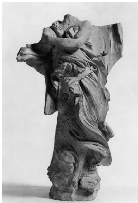
4. Angel with the Inscription , 1667–68. Terracotta, height 28.3 cm. Cambridge, Fogg Art Museum, 1937.69.