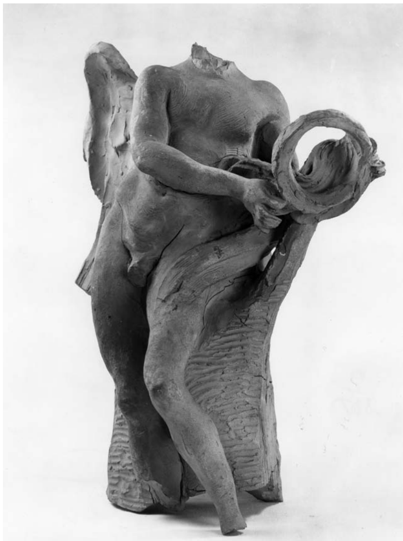
6. Angel with the Crown of Thorns , 1667–68. Terracotta, height 33.7 cm. Cambridge, Fogg Art Museum, 1937.58.