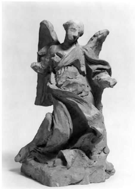
8. Angel for the Sacrament Altar , 1673. Terracotta, height 29.2 cm. Cambridge, Fogg Art Museum, 1937.66.