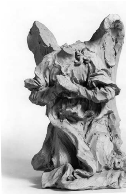
10. Angel for the Sacrament Altar , 1673. Terracotta, height 28.5 cm. Cambridge, Fogg Art Museum, 1937.64.