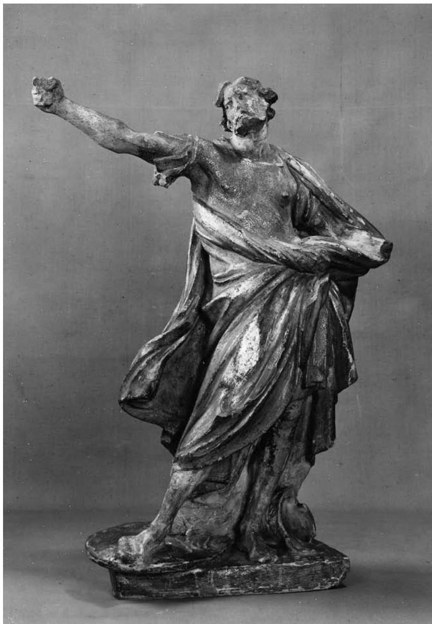
1. St. Longinus , 1630–31. Terracotta, height 52.7 cm. Cambridge, Fogg Art Museum, 1937.51.