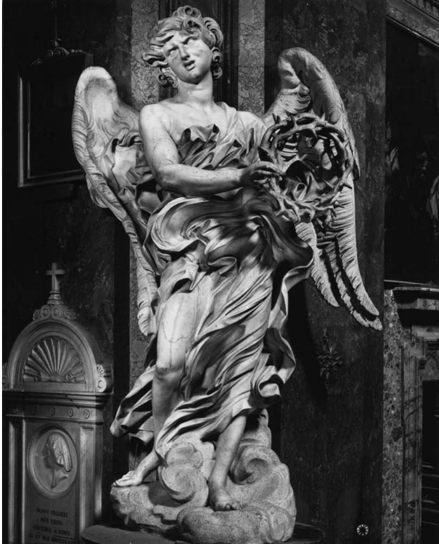
3. Angel with the Crown of Thorns , 1668–69. Marble, over life-size. Church of Sant'Andrea delle Fratte, Rome.