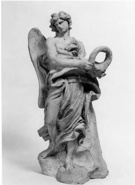
7. Angel with the Crown of Thorns , 1667–68. Terracotta, height 44.5 cm. Cambridge, Fogg Art Museum, 1937.57.