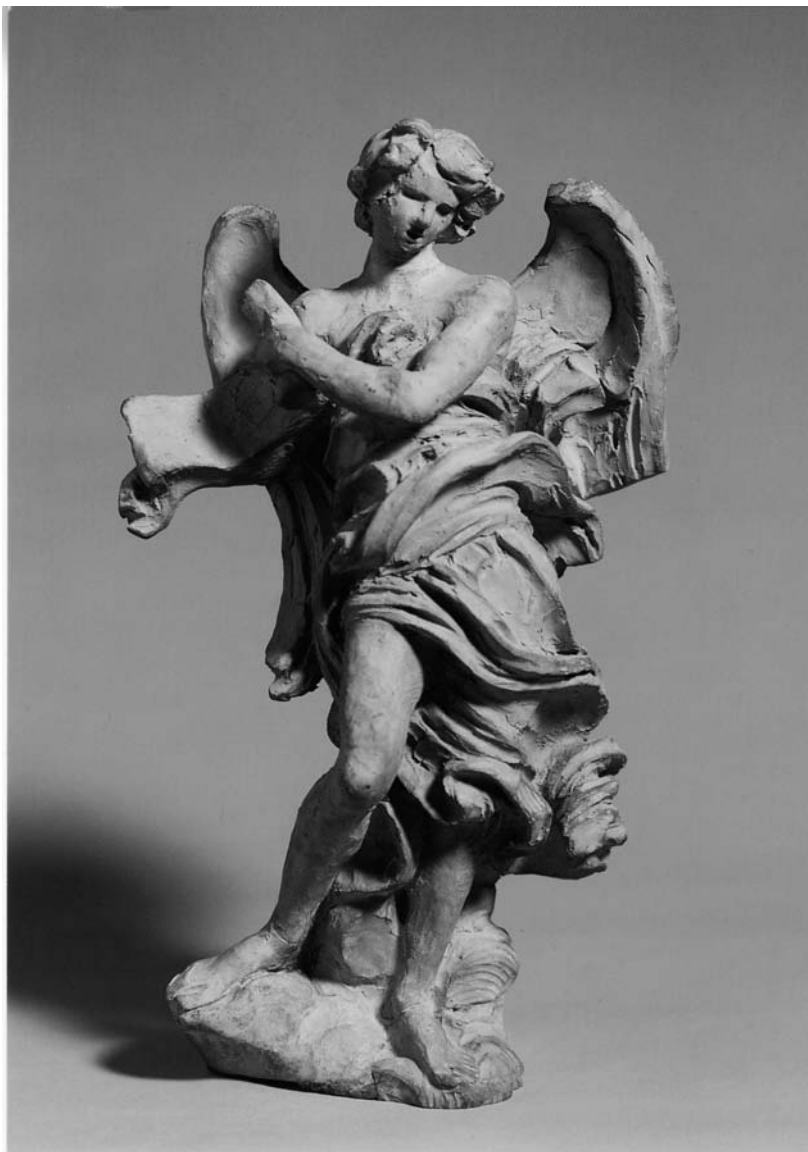
5. Angel with the Inscription , 1667–68. Terracotta, height 29.2 cm. Cambridge, Fogg Art Museum, 1937.67.